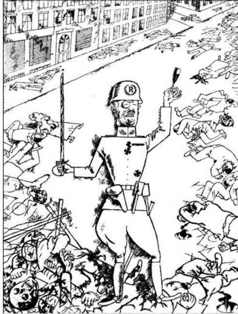
A picture of a Free Corps officer by a German artist. The officer is saying, 'Cheers Noske! The young revolution is dead.'