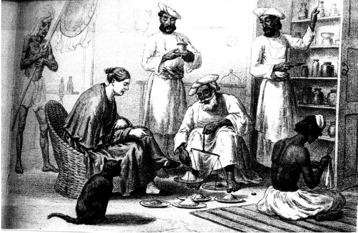
A judge's wife in early nineteenth-century India surrounded by her servants.